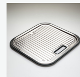
AC6320 Utility Tray