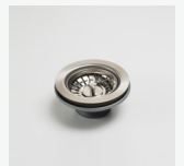
AC14 Basket Waste