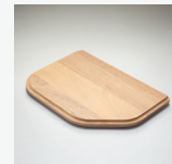
AC65 Bamboo Board